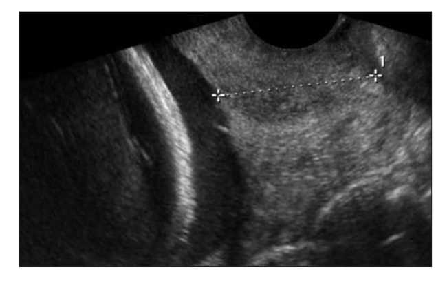
Figure 1. Two-dimensional grayscale image at 29 weeks' gestation.

Maternal medical records were reviewed for the following outcomes: gestational age at delivery, indication for delivery, birth weight, Apgar scores of the neonate, and